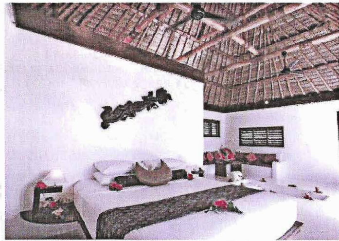
Navutu Stars Resort, Yasawa Islands, Fiji.